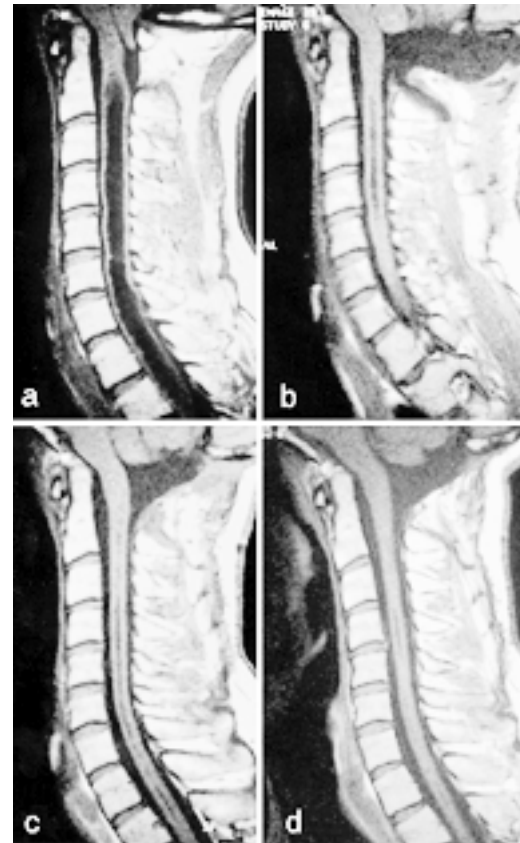
Fig. 1. Sagittal T 1 -weighted MR images. Chiari I malformation is demonstrated with tonsillar descent and an associated cervicothoracic syrinx (a). After surgery, a large artificial cisterna magna is evident. Progressive syrinx reduction was observed at 1 month (b) and at 3 months (c). A tiny residual of the cavity is visible 1 year after surgery (d).

In addition to the normalization of CSF flow patterns outside the spinal cord, a gradual reduction of fluid motion inside the syrinx was observed in Group I patients. The decrease in intraspinal flow paralleled the size reduction of the syrinx. Nevertheless, residual syrinx fluid flow was still present in 20 patients (62.5%) 1 year after sur-