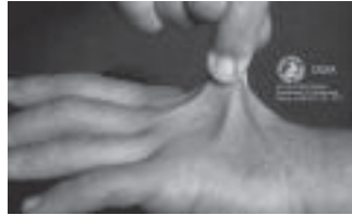
hyper elastic skin